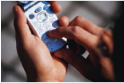
Lorem ipsum dolor

Ut wisi enim ad minim veniam, quis nostrud exerci tation ullamcorper suscipit lobortis nisl ut