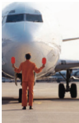
Lorem ipsum dolor

Ut wisi enim ad minim veniam, quis nostrud exerci tation ullamcorper suscipit lobortis nisl ut aliquip ex ea commodo consequat. Duis autem vel eum iriure dolor in hendrerit in vulputate velit esse molestie consequat, vel illum dolore eu feugiat nulla facilisis at vero eros et accumsan et iusto odio dignissim qui blandit s nisl. Anobis eleifend duo id option congue nihil imperdiet doming id quod mazim placerat facer possim assum. Duis autem vel eum iriure dolor in hendrerit in vulputate.